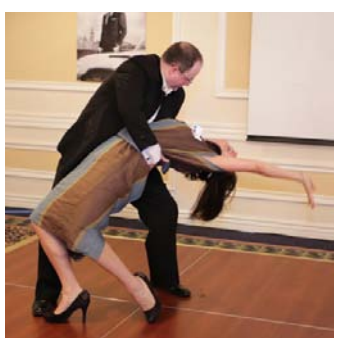
Guests were treated to private dance lessons from the Arthur Murray School of Dance

SUN, AUG 27 @ 2:00PM Pacific Palisades Tennis Center $15, members; $25 non-members