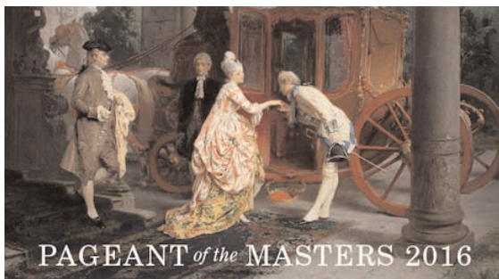
PAGEANT of the MASTERS 2016