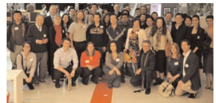
Smiling volunteers and Alumni Site Coordinators at the March 19 Kick-Off for Harvard Serves SoCal.