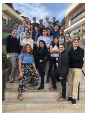
Harvardwood 101's Class of 2019

DT: While I am open as to where I end up immediately after graduation, I do hope to eventually settle back in Southern California, even if only for retirement. After growing up here, I believe that people and culture of Southern California create the perfect place to live and raise a family—the weather is just the cherry on top.