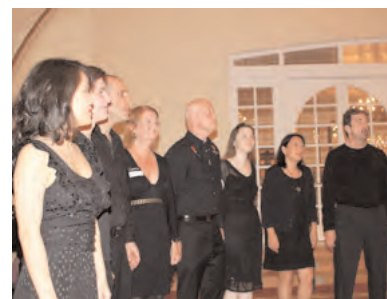
The Harvard Yardbirds entertain alumni and guests

The Harvard Yardbirds, an alumni a cappella singing group with members who span Harvard classes from the '70s through the '00s, provided the evening's entertainment.