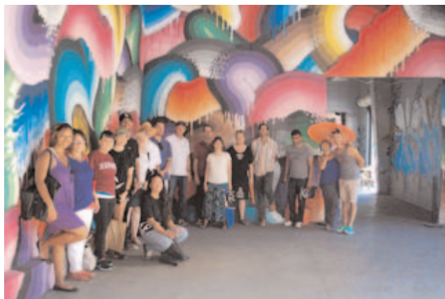
The group enjoying the art at The Container Yard.

Additional tours of the Arts District and the city of Los Angeles will be featured in a "Discover Your City" series. Stayed tuned and join us next time.