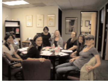
Harvard volunteers in training at Susan B. Komen for the Cure