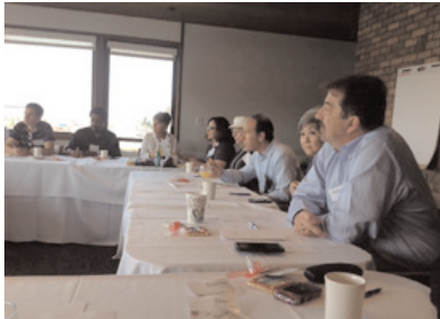
Club officers discuss ways to increase and enhance Club membership.