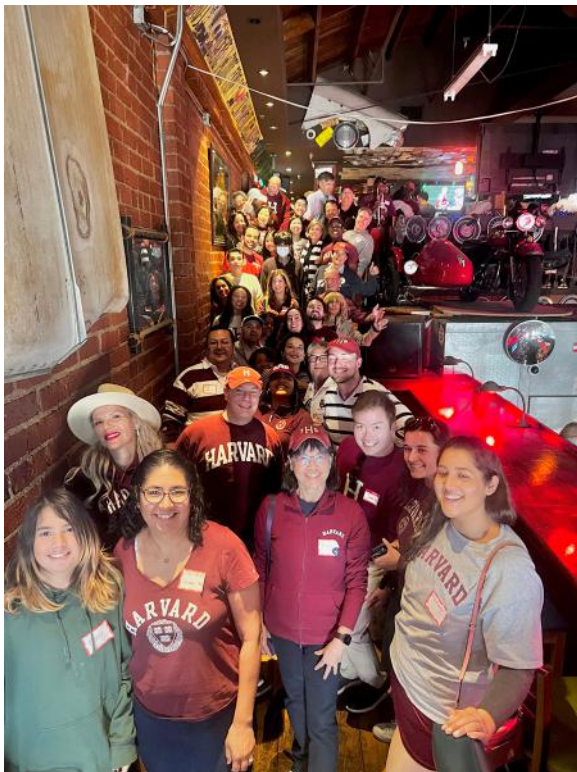
It was standing room only at the LA event at Barney's Beanery in Westwood. Despite the outcome of the game, a good time was had by all!