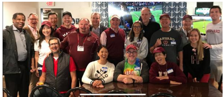
Attendees of the OC Telecast event gathered at the Elks Lodge in the Lido Marina Village in Newport Beach to watch the 138th edition of “The Game”