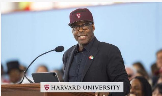
Courtney B. Vance: Candidate for Harvard Board of Overseers

The Harvard Club Board encourages all alumni to vote. Harvard is unusual among US universities in that the members of one of its two governing boards are directly elected by the alumni. Information about each of the candidates may be found on Harvard Magazine's website and on the Harvard Alumni Association website.