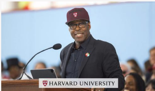
Courtney B. Vance '82 Harvard Board of Overseers