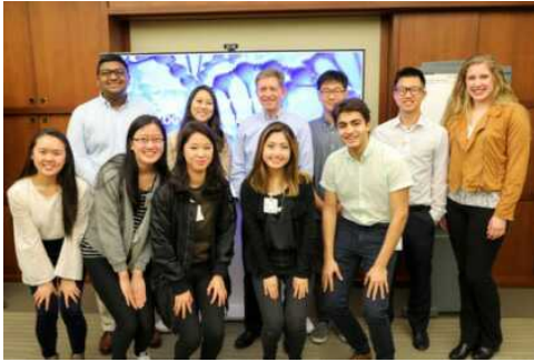
In January 2018, a group of Winternship students visited Amgen.