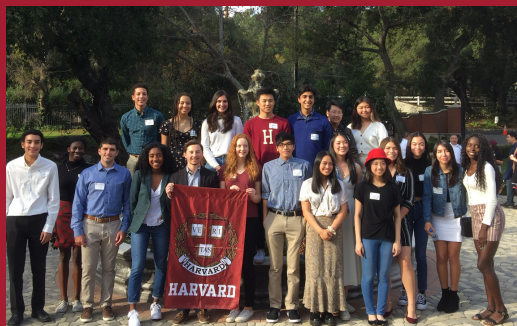
Students admitted Early Action at a reception on January 25, 2020.