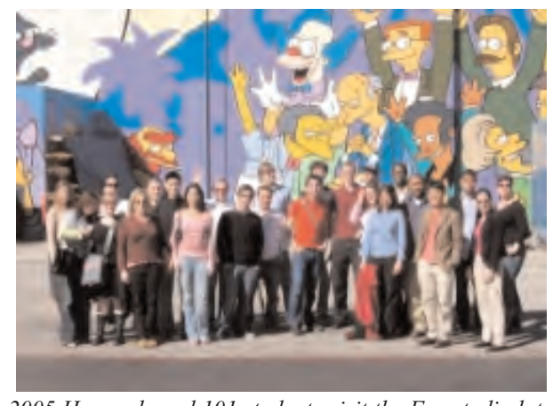
The 2005 Harvardwood 101 students visit the Fox studio lot.