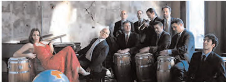
Visit pinkmartini.com for more info on the Harvard-bred musical group.