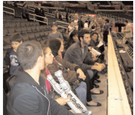
Waiting for our exclusive access to the court, post-game