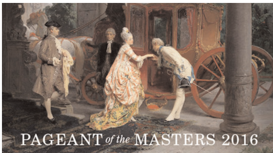
PAGEANT of the MASTERS 2016